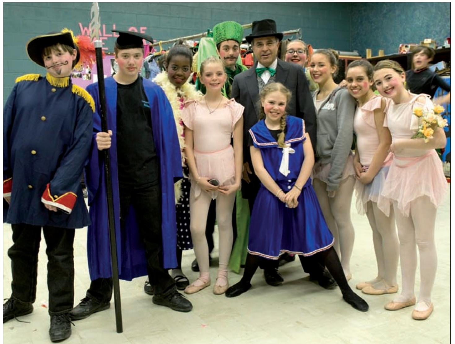
The mayor poses with the cast of Wizard of Oz last weekend at Leominster High School.

Small groups of spectacular students - portraying everything from Lollipop Kids