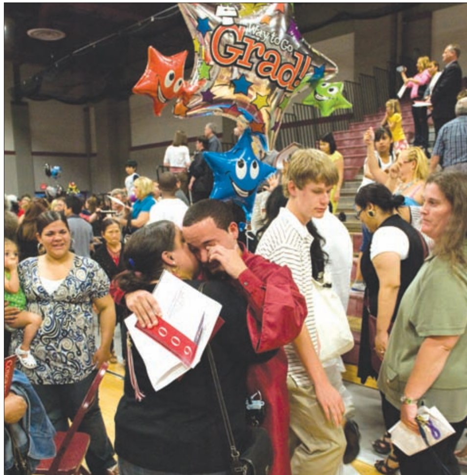
After commencement, an FHS graduate is overcome with emotion when he sees his family.